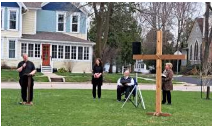
Community Good Friday service at Veterans' Park.